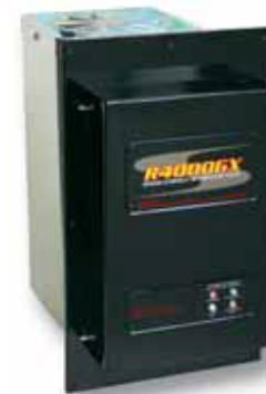
From 1500 sq. ft to 4000 sq. ft Home *Commercial 2000 cfm model also available