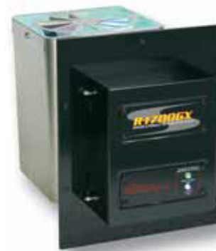
Up to 1700 sq. ft Home