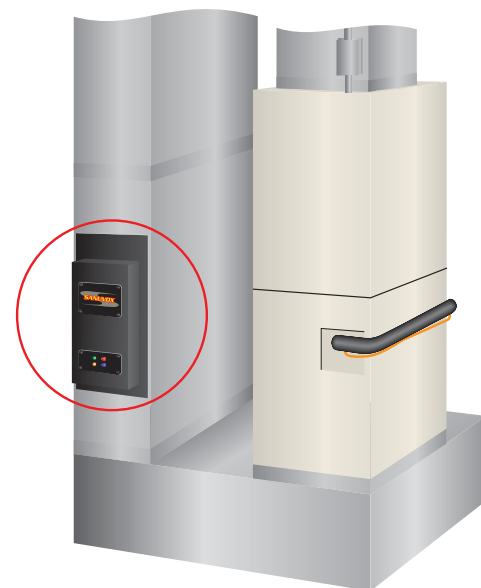
Return or Supply Plenum Installation